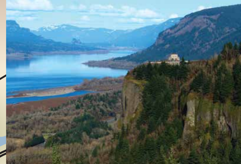
Once known as Thor's Heights, Crown Point was shaped by the same floods, winds, and volcanic lava flows that created the Gorge.