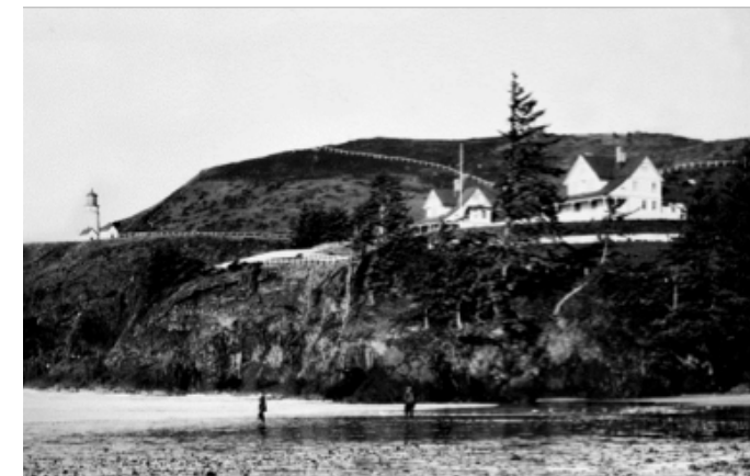
Heceta Head circa 1911

Construction of the lighthouse began in 1892. Building materials were unloaded from ships and rowed to shore or transported via horse-drawn wagon from Florence and then carted up the hill. Stone for the lighthouse came from the Clackamas River; the bricks came from San Francisco. The finished complex consisted of the 56-foot-high lighthouse; housing for the head lightkeeper, two assistant lightkeepers, and their families; a barn; and two kerosene oil houses.