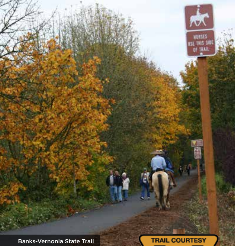
Banks-Vernonia State Trail