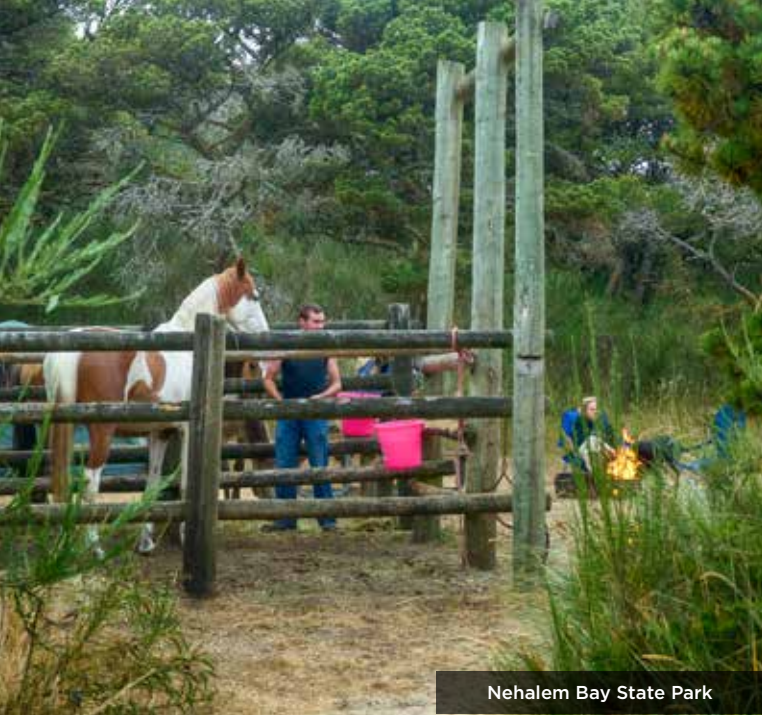
Nehalem Bay State Park