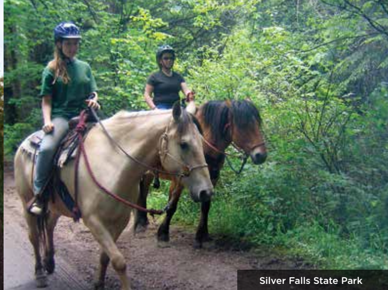
Silver Falls State Park