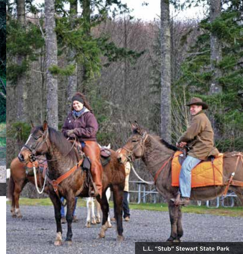
L.L. "Stub" Stewart State Park