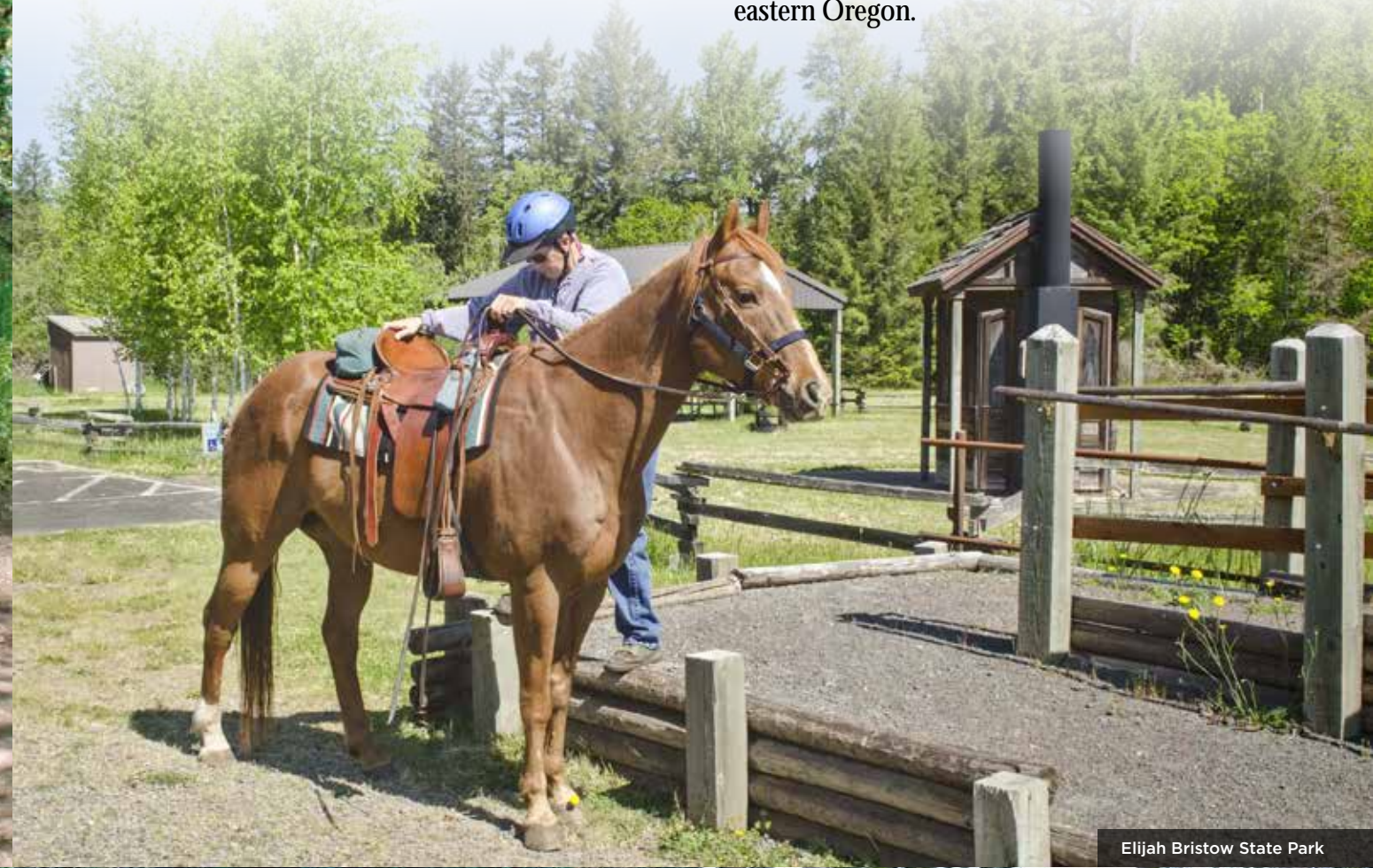
Elijah Bristow State Park

Call the State Parks Information Center, 800-551-6949, for additional information on horse trails and horse camping.