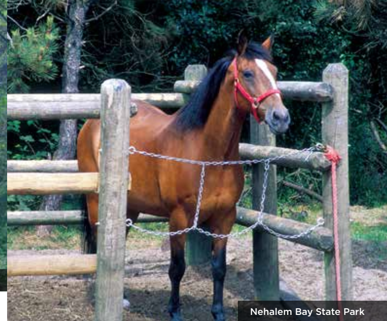
Nehalem Bay State Park