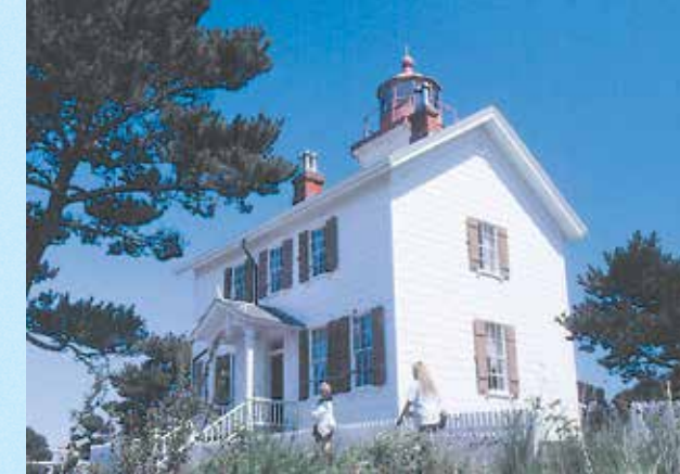
Yaquina Bay Lighthouse