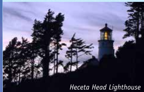
Heceta Head Lighthouse

Oregon's coastal lighthouses are visible links to the past—towering monuments to Oregon's maritime heritage and the service of its light keepers. Although unoccupied since the arrival of modern technology, these classic structures remain as much a part of Oregon's rugged coastal landscape as any land form or offshore monolith.