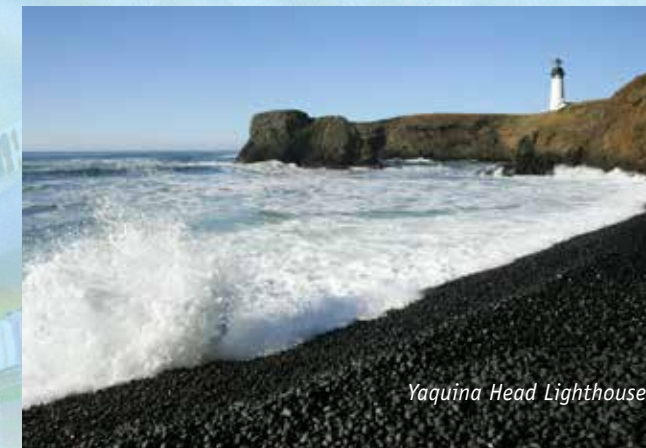
Yaquina Head Lighthouse