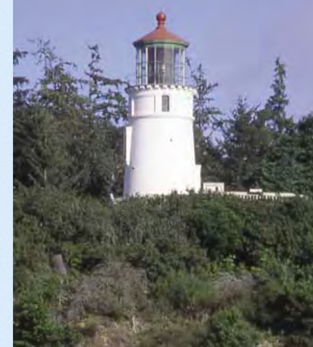
Umpqua River Lighthouse