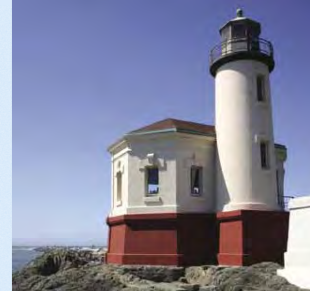
Coquille River Lighthouse