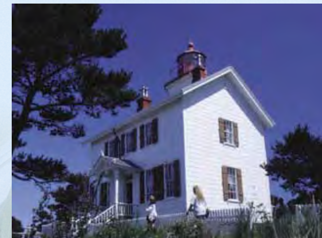
Yaquina Bay Lighthouse

For information on hours and tours, call the State Park Information Center—1-800-551-6949—or other phone numbers in this publication.