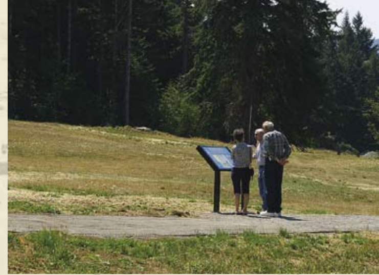
Panels placed along the trail share glimpses of fort life.