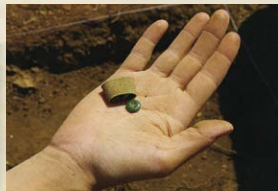
Relics of daily life.