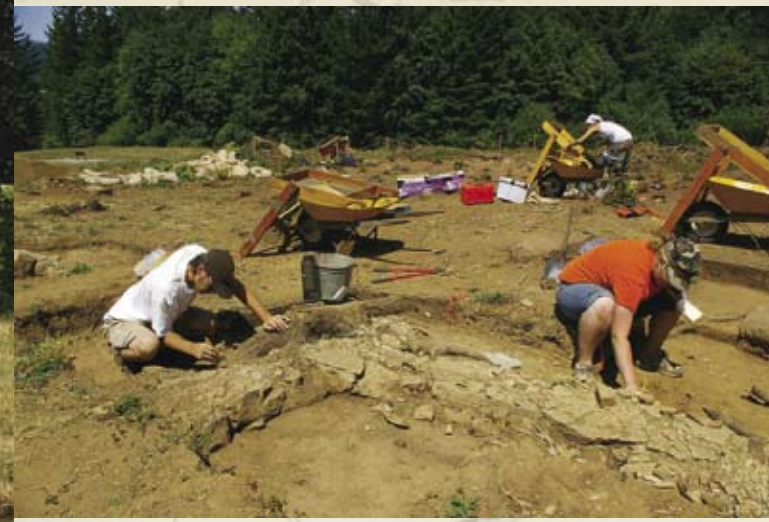
Student archaeologists unearth the foundation of a fort building.

This heritage area is a joint project of the Oregon Parks and Recreation Department and the Confederated Tribes of the Grand Ronde Community of Oregon.