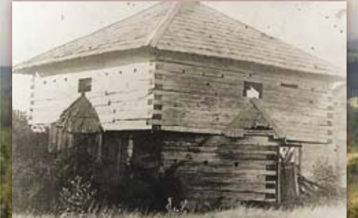
Fort Yamhill Blockhouse after it was moved to Grand Ronde, Oregon.