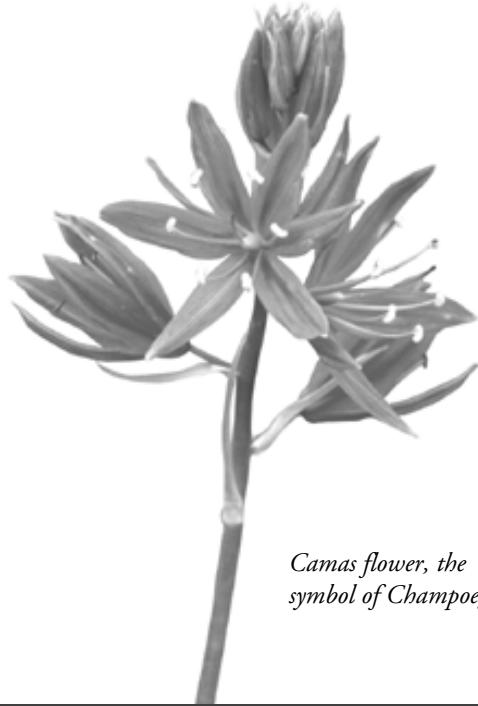
Camas flower, the symbol of Champoeg

Annual Meeting Saturday January 5 Times to be announced