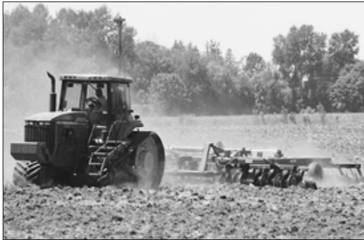
Ten acres of hayfield is plowed to make way for dry prairie in the summer of 2000.

By spring 2001, our dry prairie had germinated and was doing very well. So far, success. The question is, how well can we sustain this little bit of prairie over several years? There are some weeds—mustard, chickweed, some clover—that will probably get choked out and won't cause long-term problems. But there is also a little Meadow Foxtail, an aggressive,