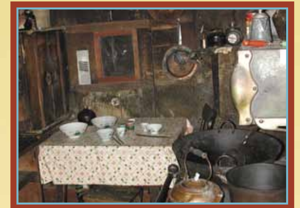
Kitchen area, including antique wok