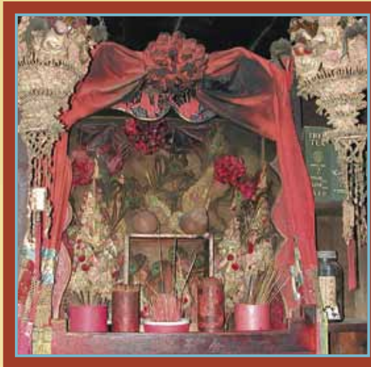
Shrine for religious rituals