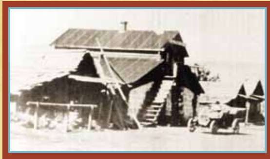
Kam Wah Chung in 1909