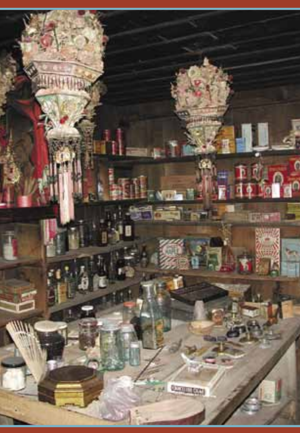
General store merchandise

Once it was a general store, a doctor's office, a post office, a library and a center of Chinese social and religious life. Now it is a museum—one of the most unusual you will find anywhere.