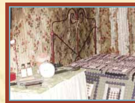
Doc Hay's bedroom

You can easily imagine the venerable doctor mixing remedies in the apothecary, which was protected by iron window bars. His medical supplies, which he imported from China, included at least 500 different herbs. Many are rare with unknown uses. They ranged from common clove, ginger and red pepper products to such items as wild asparagus, chicken gizzards, tortoise shell, pomegranate bark and cocklebur.